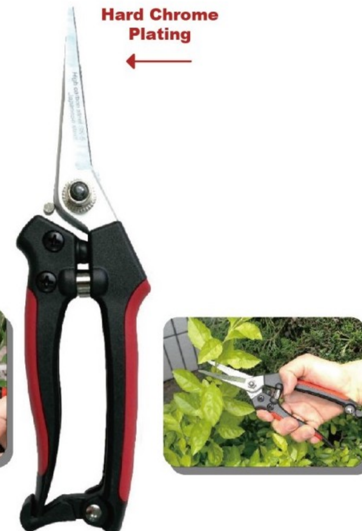
#3152P-2L 200mm Cutting Capacity: 6mm