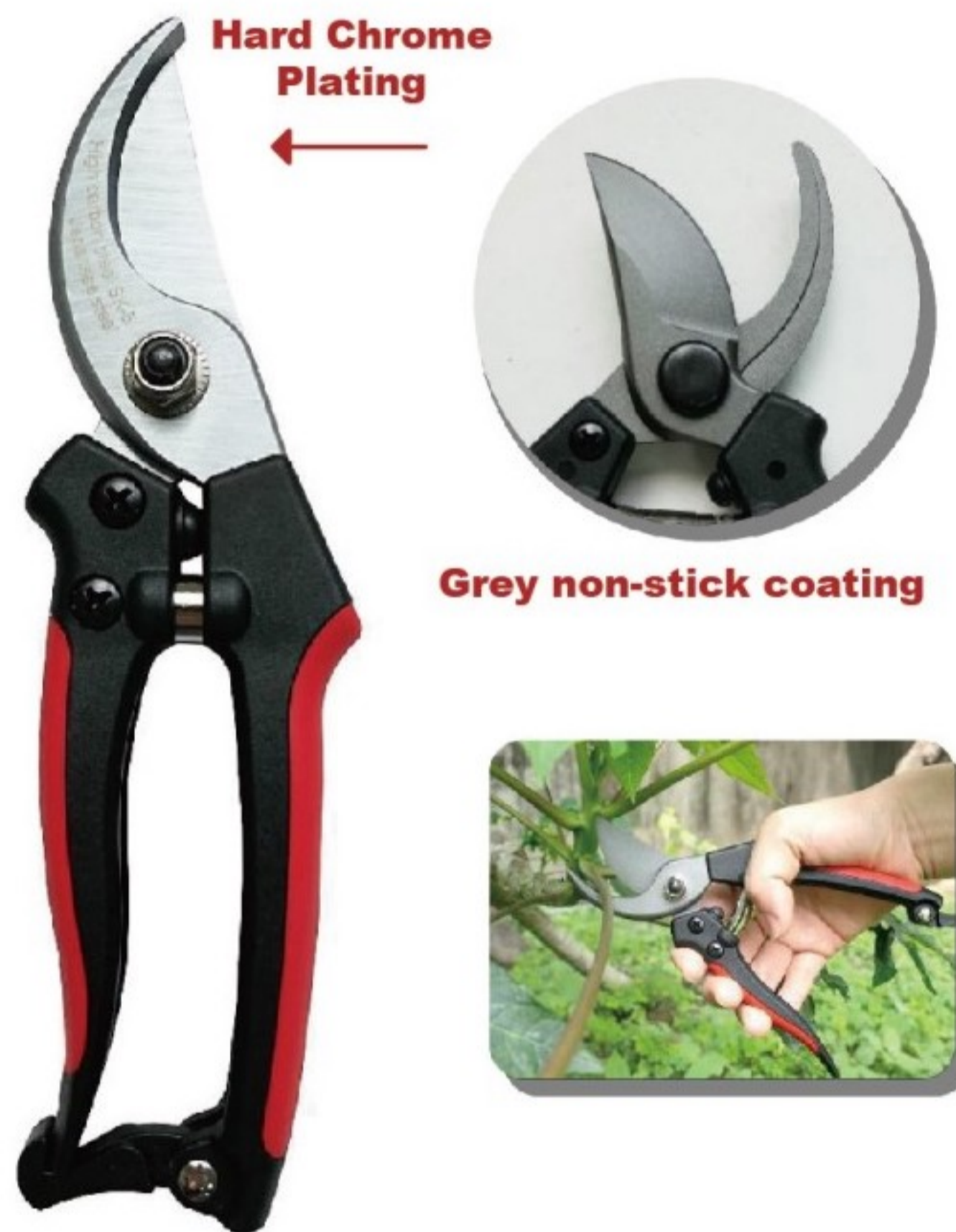
#3152P1 180mm Cutting Capacity: 12mm