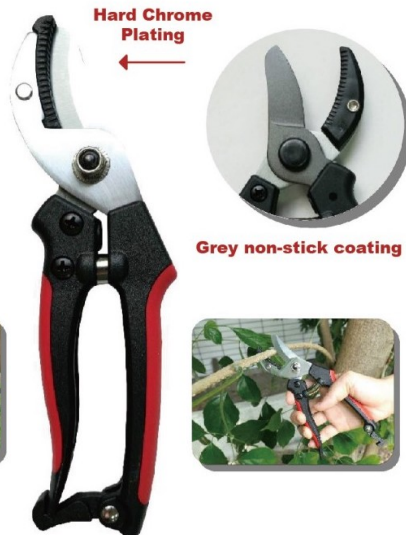
#3152PNC-1 180mm Cutting Capacity: 12mm