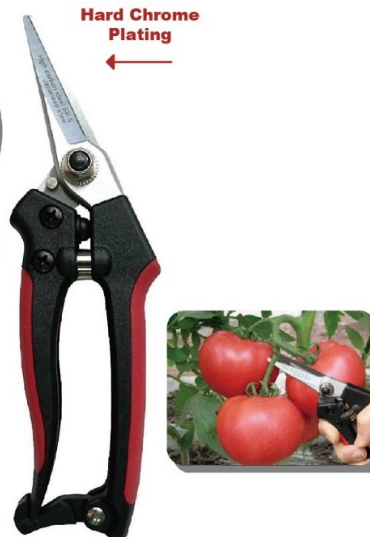
#3152P-2 178mm Cutting Capacity: 6mm